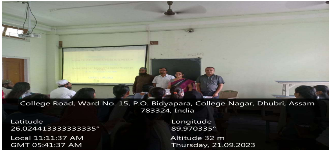
Teaching staff of Sanskrit & Arabic Department present in the Lecture Programme